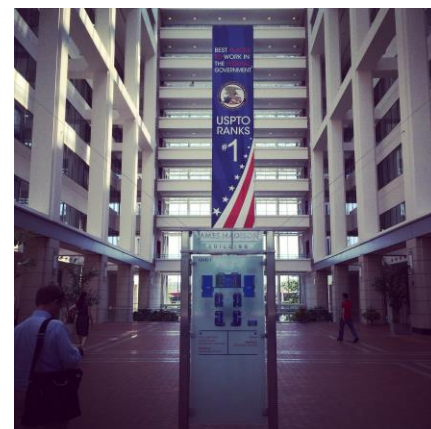
A peek inside the U.S. P.T.O. building in Washington, D.C.