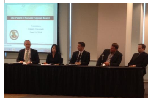
USPTO panelists speaking to our students.