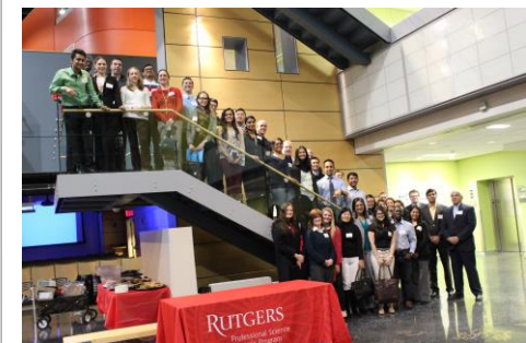
The Spring 2014 Fundamentals of Regulatory Affairs class.