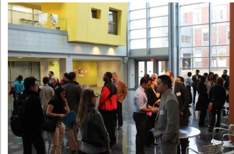
MBS students networking with panelists and recruiters during the 2 nd Annual MBS Regulatory Affairs and Drug Discovery & Development Event.