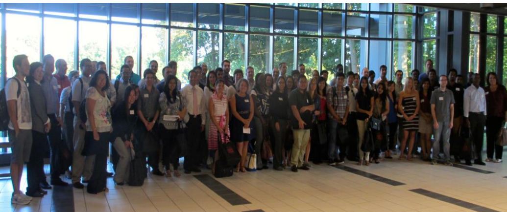
Fall 2014 New Student Orientation