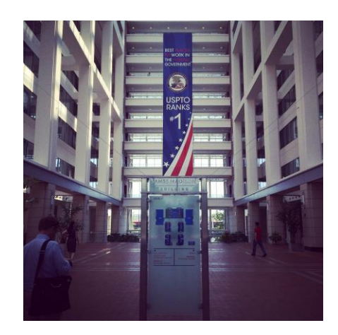
A peek inside the U.S. P.T.O. building in Washington, D.C.