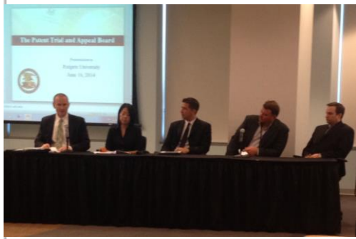
USPTO panelists speaking to our students.