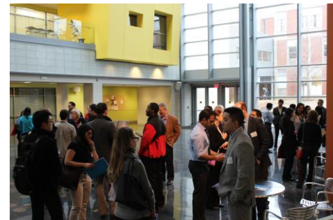
MBS students networking with panelists and recruiters during the 2 nd Annual MBS Regulatory Affairs and Drug Discovery & Development Event.