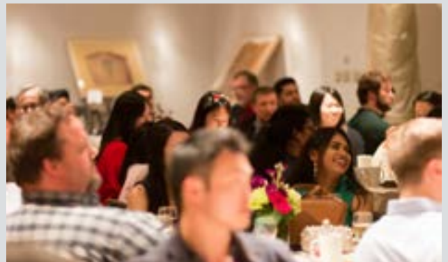
New MBS graduates enjoy a night of celebration that included a delicious dinner and drinks.