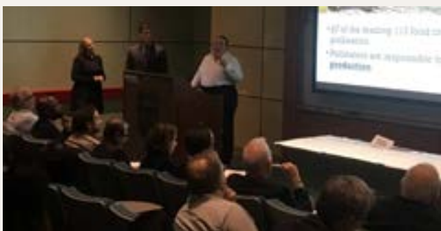
MBS Capstone students (above) present their business plans to distinguished judge-coaches: corporate representatives, MBS professors, alumni, and students.

Through the Capstone course, students hone their entrepreneurial skills by developing a business start-up based on an emerging technology. Paired into multidisciplinary teams, students research patented technology, identify ideal product use, and develop business plans to take products from concept to market. Projects culminate with teams making 10-minute presentations to "prospective inventors"—the project judges. Each team is evaluated for innovation, supportive research, and overall business presentation.