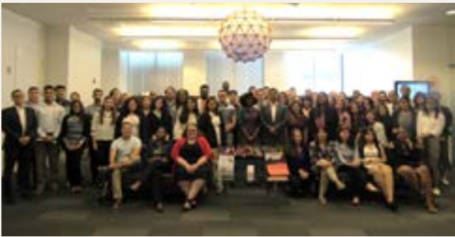
Students from the Fundamentals of Intellectual Property course after a day at the United States Patent and Trademark Office (USPTO) on June 19, 2019